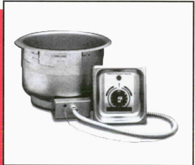
MODEL SM-50-11D UL HOT FOOD WELL